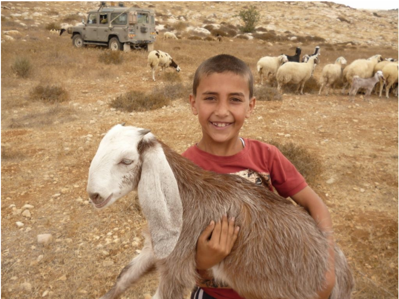
Shepherd boy, Umm al Ahmad

MAY GOD DIRECT ITS USE, MOVE US TO LIVE LIVES OF SERVICE, AND BLESS ALL PEOPLE THIS CHRISTMAS SEASON. AMEN.